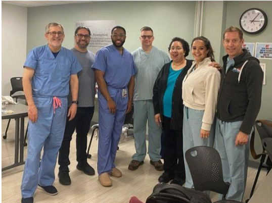
(Click to Enlarge)

Sheet, Pelvic Stabilization with Binder, and Bag Valve Mask Ventilation. Additional new videos will be included to complement ATLS 11 courses and enhance the learner experience.