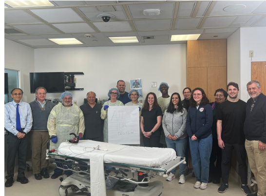
(Click to Enlarge)