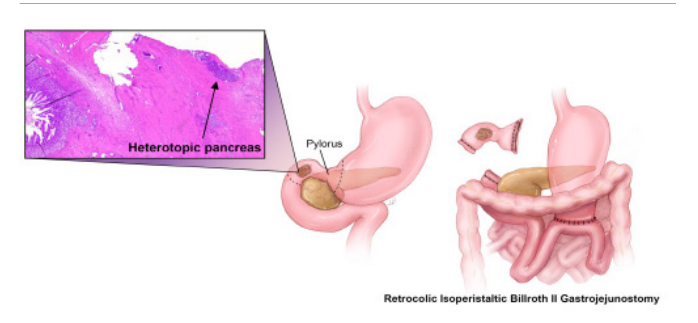
Figure 2. Illustration Depicting Retrocolic Isoperistaltic Billroth II Gastrojejunostomy and Excised Specimen

Laparoscopic rendering of the operative field demonstrating a retrocolic isoperistaltic Billroth II gastrojejunostomy after resection. Inset: histopathology confirming the presence of heterotopic pancreas near the gastric antrum