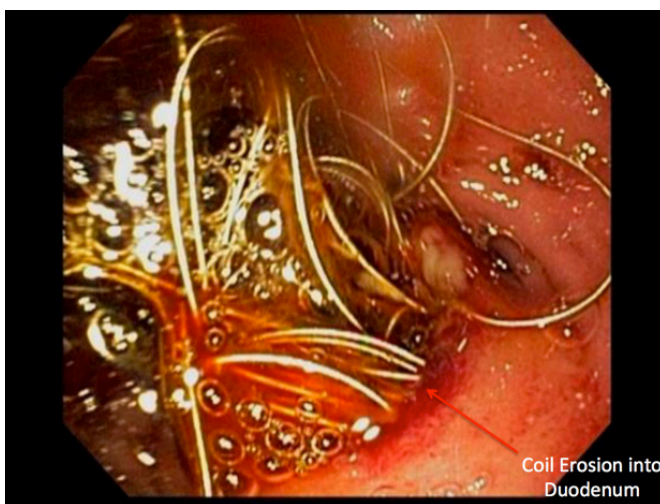
Figure 3. EGD depicting the presence of coils in the duodenum.

An EGD with push enteroscopy performed the following day confirmed the erosion of coils into the second and third portions of the duodenum (Figure 3).